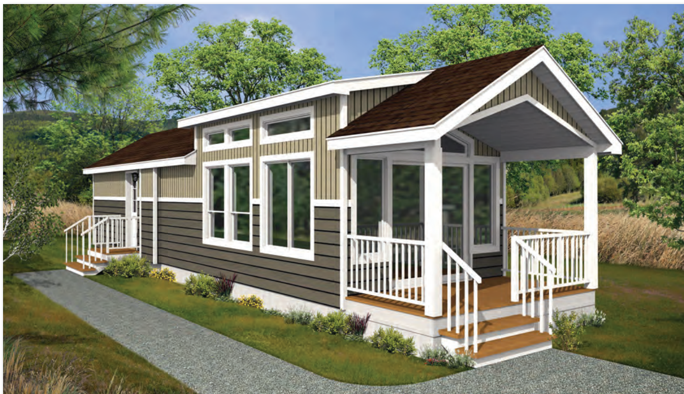
2 BDRM, 1 BATH, FRONT LR | 12'x44' | 536 sqft | 12PM44002